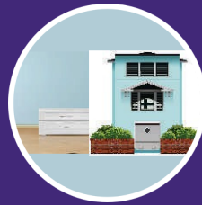
Ideal For Internal & External Walls