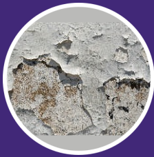
Prevents flaking of Paint