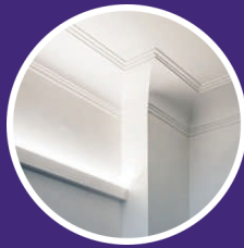
Strong Bond With base plaster